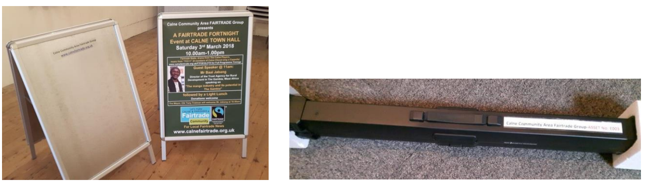
We also have many images of the banners and posters deployed in the Town Centre if you wish to see them.